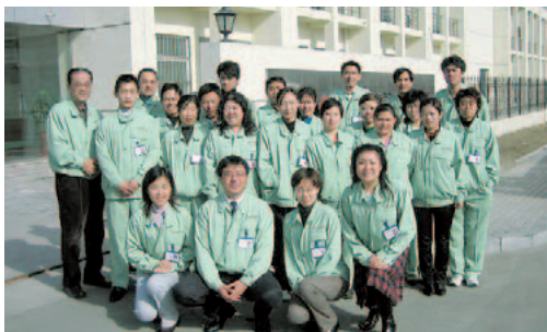
Local staff of Tianjin VIAM Automotive Products