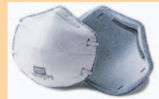
Disaster relief masks

Japan Vilene promotes a variety of social contribution initiatives through its Social Contribution Task Force. We have also set up corporate social responsibility (CSR) subcommittees in all Group businesses, which undertake activities in close liaison with their respective local communities. Examples include provision of financial support for foster children through the auspices of the Japan Foster Plan Organization and the donation of daily necessities to various welfare organizations. Other ongoing efforts include assistance in opening welfare facilities to the community, participating in community cleanups and blood donation drives, and providing aid for the reconstruction of areas affected by disaster. The Group has its own guidelines for providing products related to disaster relief. To date, we have donated masks and other nonwoven products for cleanup activities related to volcanic explosions and oil spills. During the SARS epidemic, we supplied masks to medical staff working in China and other affected regions.