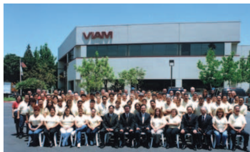
California plant of VIAM Manufacturing, Inc.