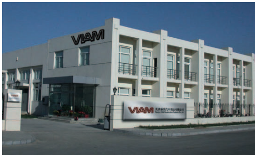
Head office and factory of Tianjin VIAM Automotive Products Co., Ltd.

In March 2005, it commenced production at its plant in the Xiqing Economic Development Area in Tianjin City. Sales in its initial year of operation are estimated at around ¥400 million. The Japan Vilene Group has been involved in the car floor mat business for 31 years in Japan and 20 years in North America. The objective behind the establishment of this new company in China is to develop its business in the local market. With established production bases in Japan, North America, and China, the Group will meet the needs of automakers worldwide.