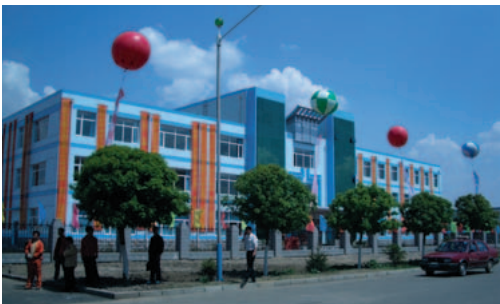
Head office and factory of Freudenberg & Vilene Filter (Changchun) Co., Ltd.

The new company began production at its new plant in the Changchun Economic and Technology Development Zone in January 2005. It manufactures a range of automotive filters, including engine air filters and cabin air filters, which are sold to automobile companies in northeast and northwest China. Sales in its first year in operation are forecast at around ¥1.3 billion.