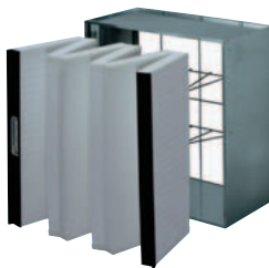
VILO TOPIA VZDH, part of the Ecoalpha Series of environmentally friendly air filters